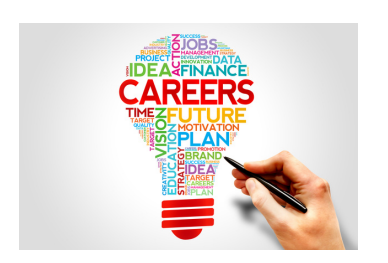
Participation will be limited.

Information about the course registration process for 2025-2026 will be discussed along with other topics.